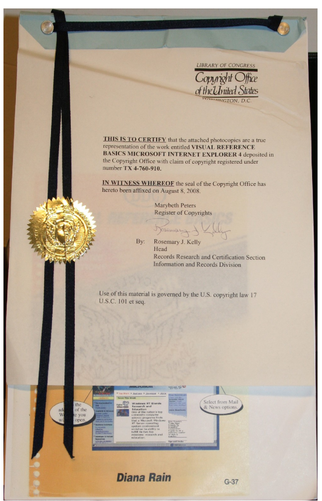
Certified copy of a publication from the United States Copyright Office.

Interestingly, the United States Copyright Office and the Library of Congress offer similar certified versions of books. A party to litigation can submit to either of these offices a list of the publications they need