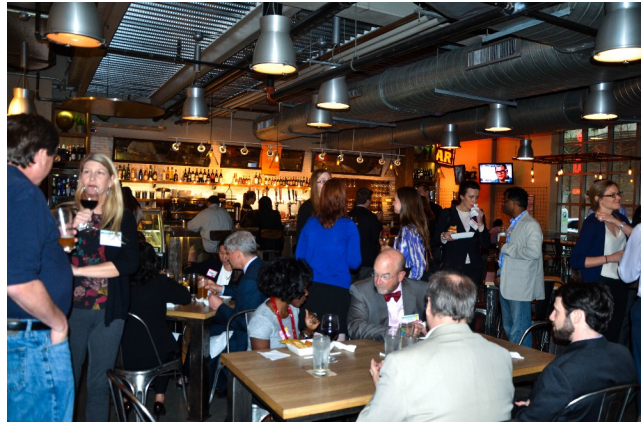
Attendees at the New Lawyers Committee kick-off event.